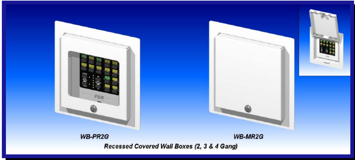
WB-MR2G, WB-MR3G, WB-MR4G, WB-PR2G, WB-PR3G, WB-PR4G