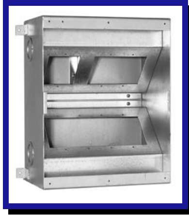
FL-2.25P, FL-3P, FL-4P, FL-6P, FL-8P